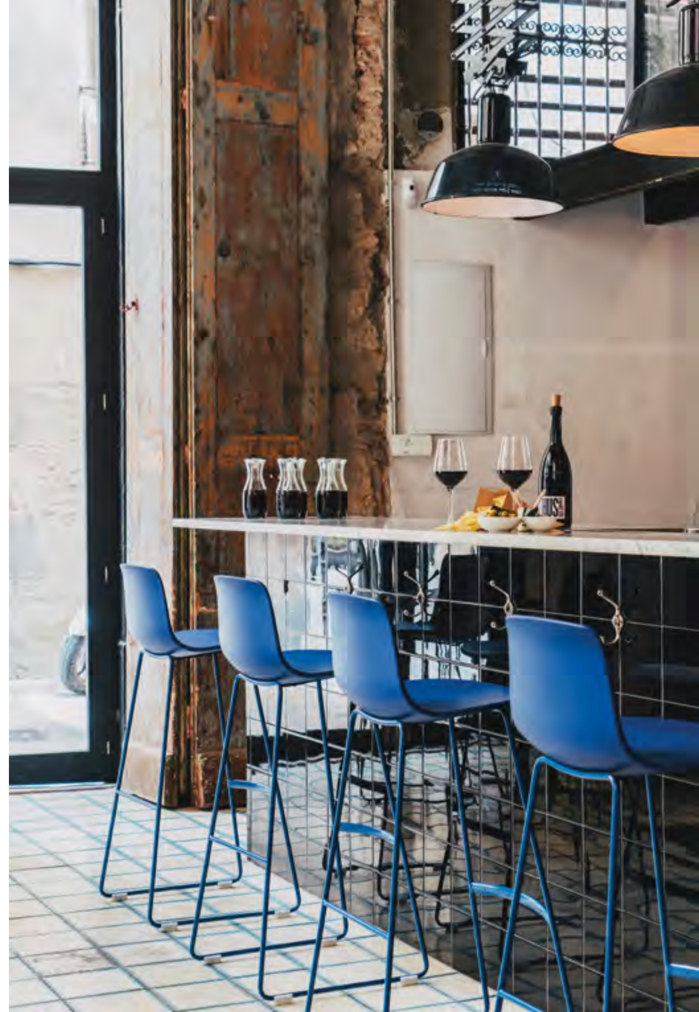
On the right: Lottus stool (ref. 4752) in Pantone 7545C monochrome.