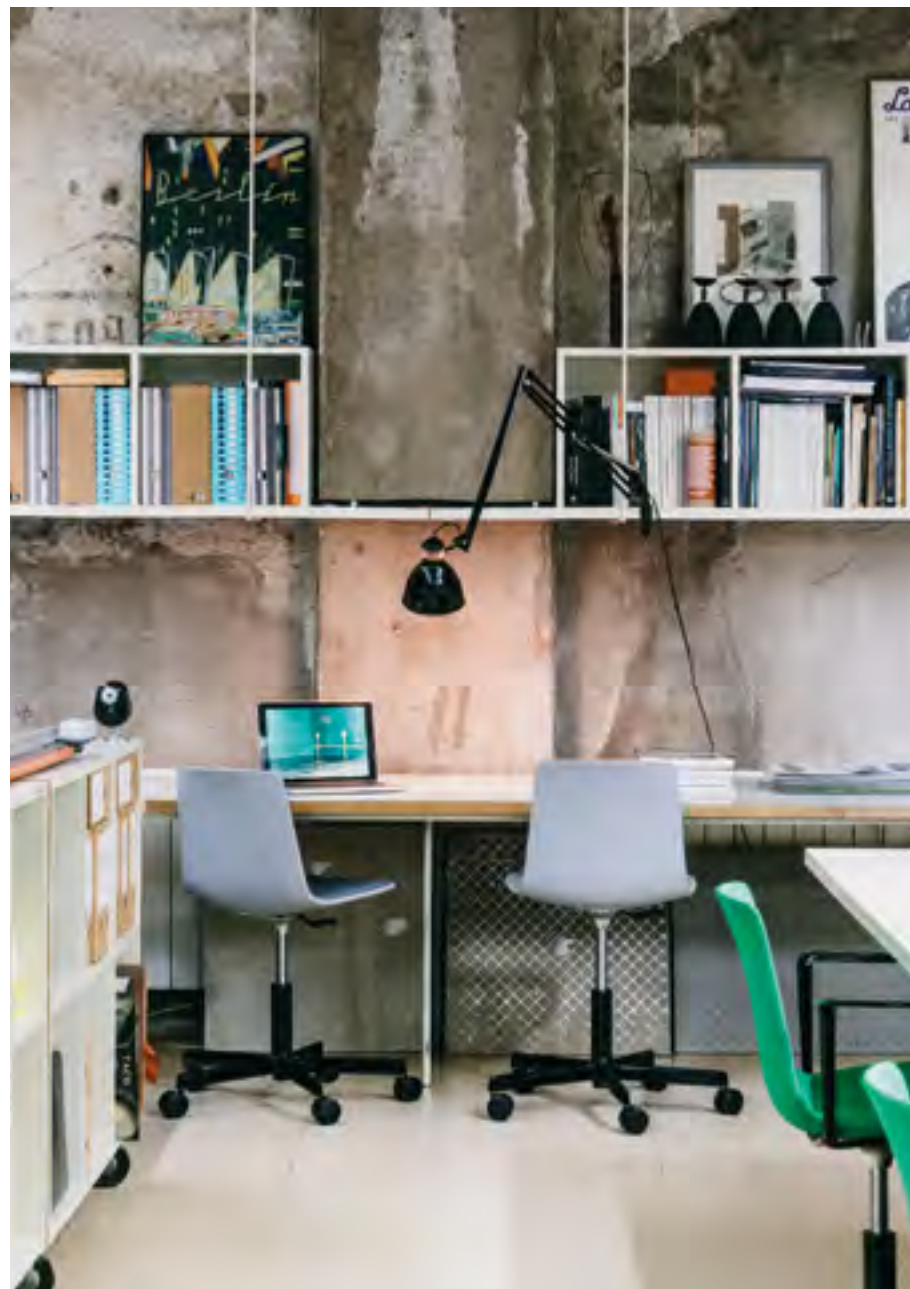
Lottus office chair (ref. 5309) in RAL 9005 structure, shell in RAL 7004 PP and pad upholstered in Step 60092. Lottus office chair (ref. 5300) with arms and base lacquered in RAL 9005 and fully upholstered seat.

Con su resistente base con ruedas, más adaptable al entorno de oficina, Lottus resulta ideal para los espacios de trabajo.