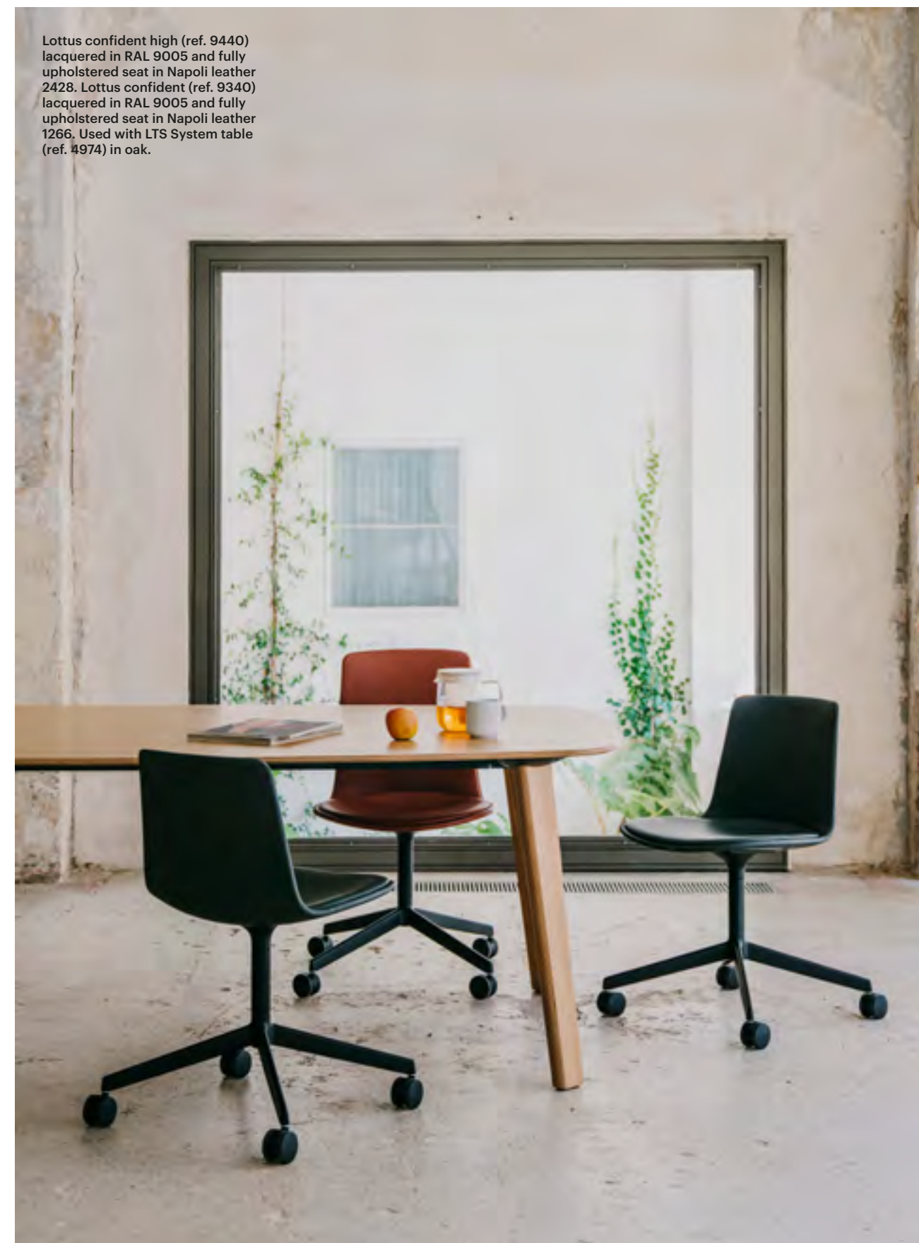
Lottus confident high (ref. 9440) lacquered in RAL 9005 and fully upholstered seat in Napoli leather 2428. Lottus confident (ref. 9340) lacquered in RAL 9005 and fully upholstered seat in Napoli leather 1266. Used with LTS System table (ref. 4974) in oak.