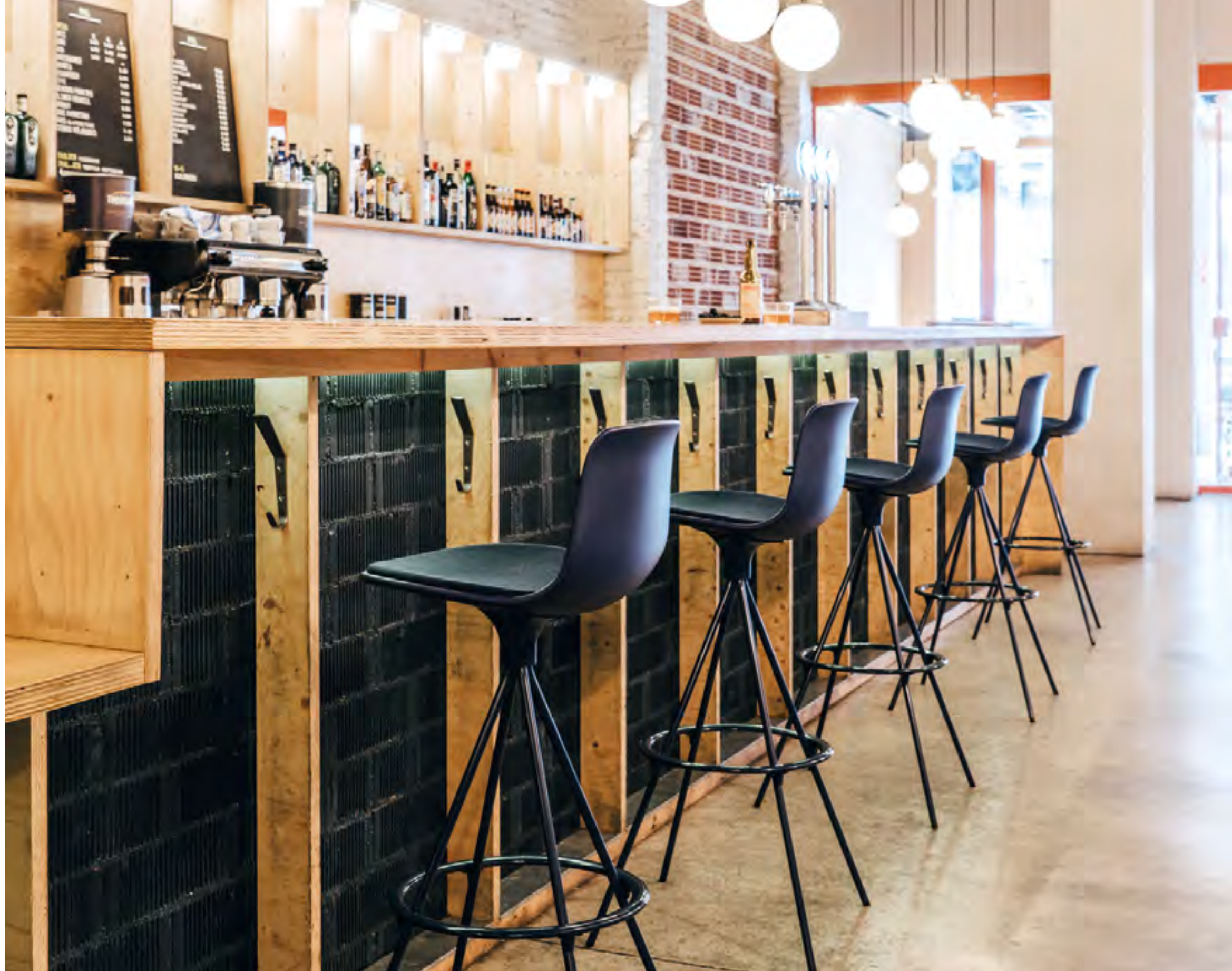
Lottus 4-legged stool (ref. 4750), shell in RAL 9005 polypropylene, upholstered pad in Fame 66071. Lacquered in RAL 9005.