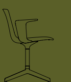
CONFIDENT WOODEN ARMS W 560 H 775 D 525