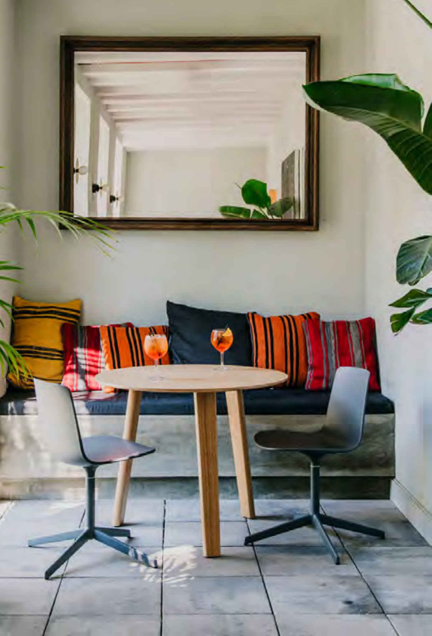
Lottus confident (ref. 9343) in monochrome RAL 7016 accompanied by LTS System table (ref. 4974) in oak.