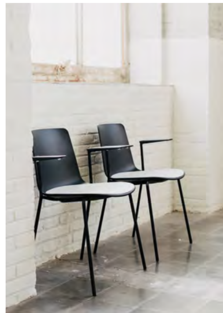
Lottus chair (ref. 4800) lacquered and PP shell in RAL 9005 with RAL 7004 pad.

Gracias a la amplia gama de materiales y acabados, Lottus es tan diversa como nuestros clientes.