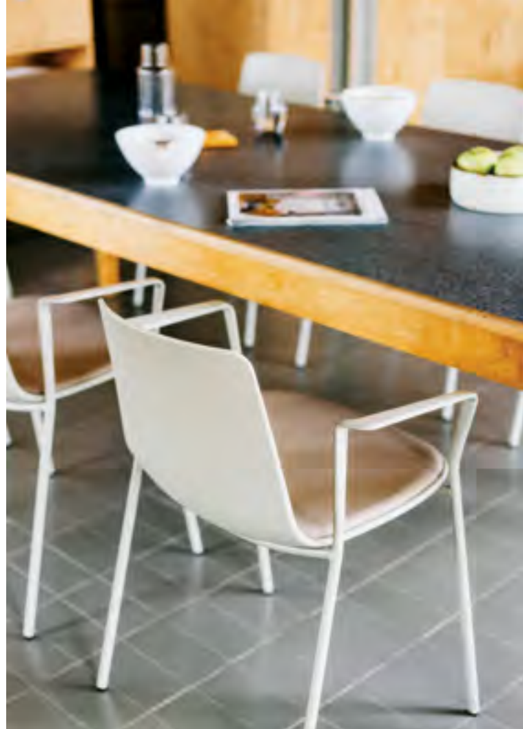
Lottus chair (ref. 5500) lacquered in RAL 7032, shell in RAL 7032 polypropylene and pad upholstered in Blazer CUZ47.

La línea sencilla y la esencia de Lottus se adaptan con estilo a los distintos espacios.