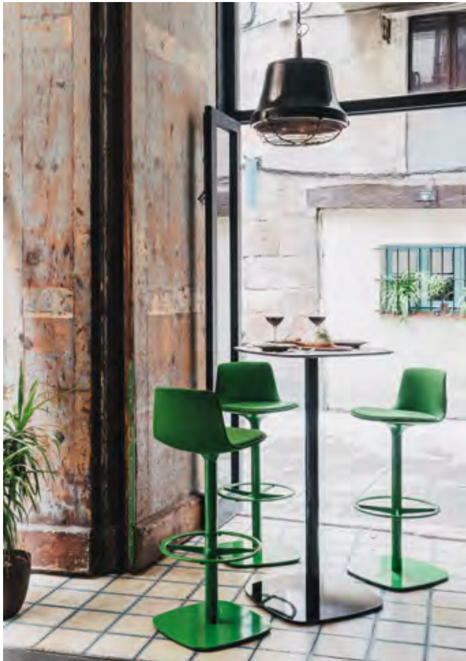
Lottus stool (ref. 4700) with a structure and PP shell in custom colour and pad upholstered with Lottus table.