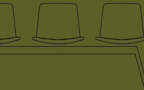
2/3/4/5 PLACES W 1395/1965/2535 H 775 D 516