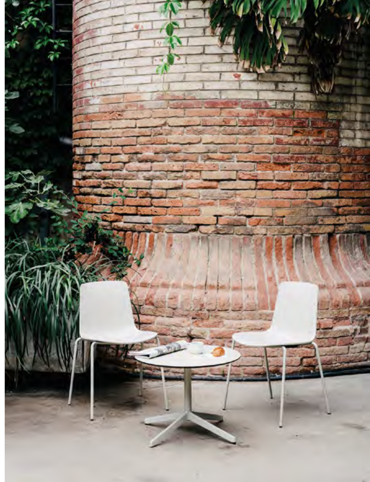
Lottus chair (ref. 4801) in monochrome RAL 7032 accompanied by the Lottus table (ref. 4941) with structure and special HPL top in RAL 7032.