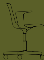
OFFICE CHAIR WOODEN ARMS W 612 H 790-920