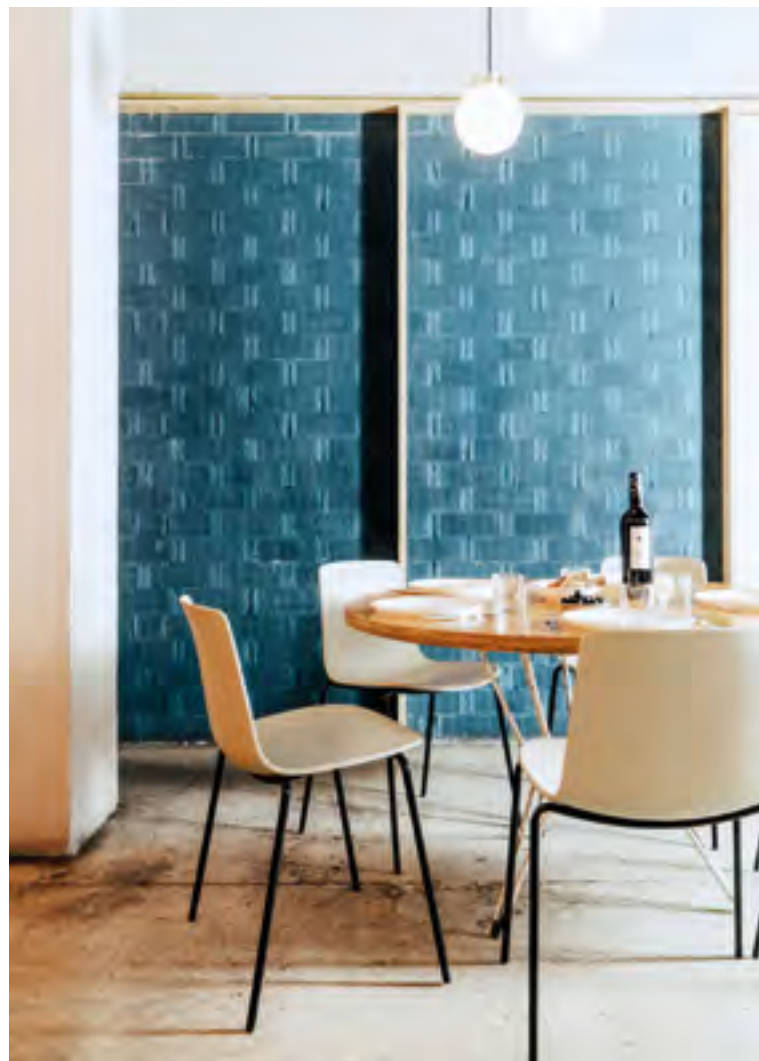
Lottus chair (ref. 4801) with RAL 7032 polypropylene shell and structure lacquered in RAL 9005.

Su curvatura natural, producto de la excelencia de su diseño, se ubica cómodamente entre la formalidad y el confort.