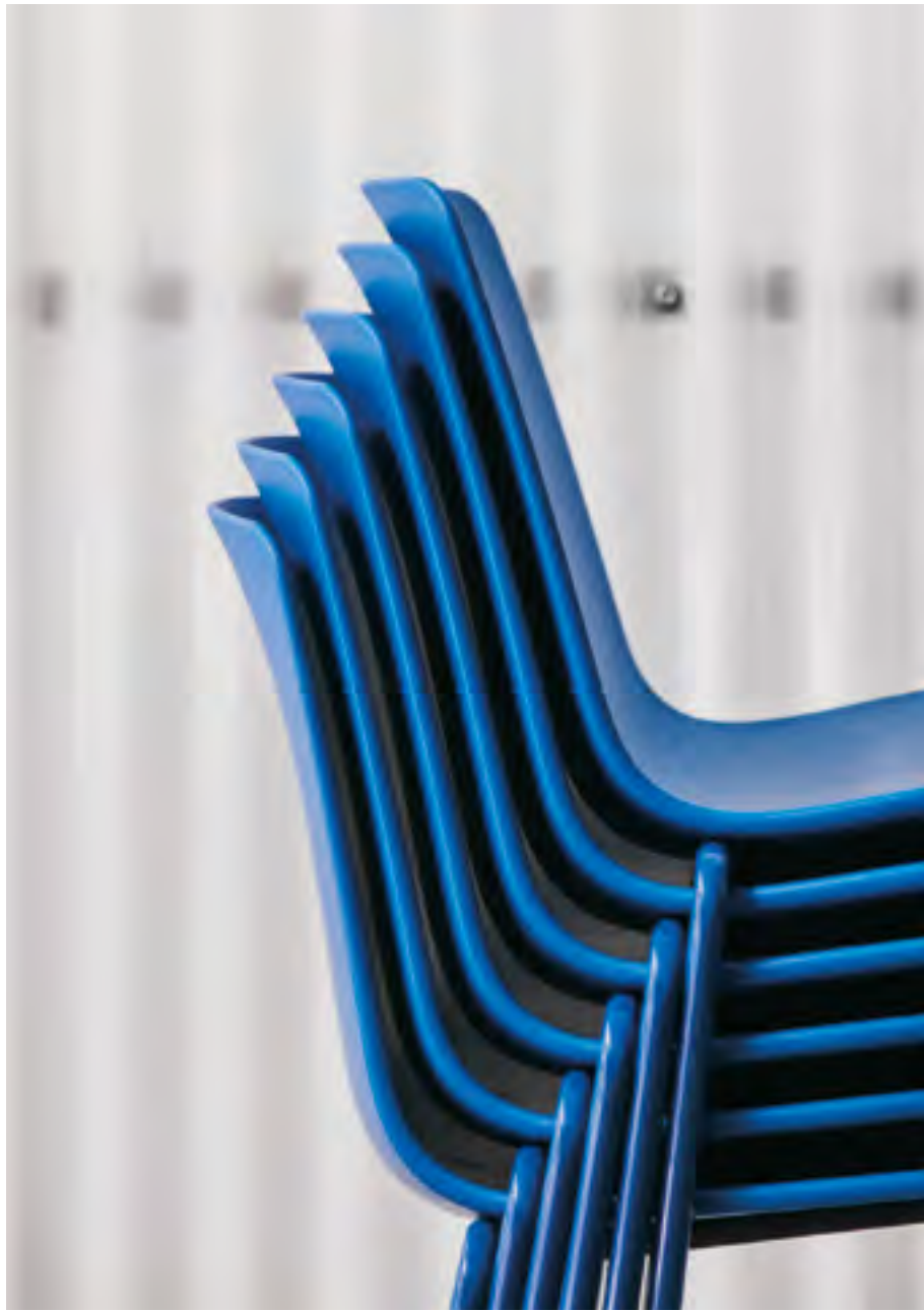
Lottus chair (ref. 4801) in custom monochrome colour.