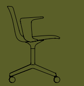
CONFIDENT WITH WHEELS WOODEN ARMS W 560 H 775 D 525