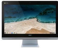
Chromebase All-in-One CRM