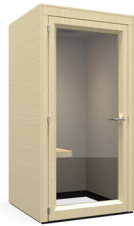
Wellness Plus PXP-SUP