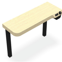
Height-adjustable Desk HAD