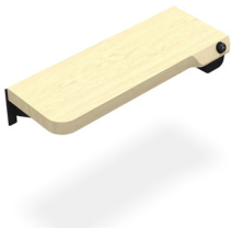
Fixed Height Desk FHD