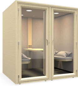
Glazed front, Upholstered back PHP-GPB