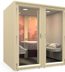
Custom Graphic GRA