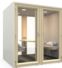
36mm MFC M36