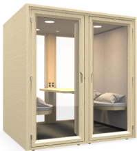
36mm Ply P36