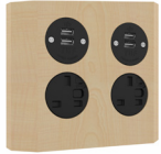
Basic Power Module PSG