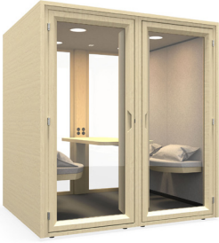
Glazed front & back PHP-GGB