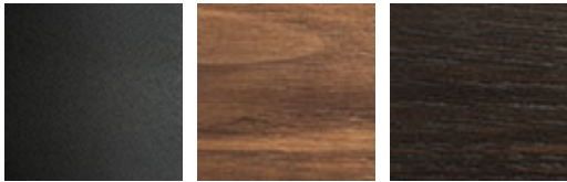
GF69 embossed graphite