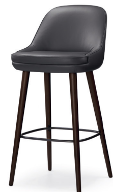
Back-up: the 375 Barstool with a backrest was developed for relaxed seating at a counter or bar

“We wanted to develop a classic barstool which would offer great seating comfort but nevertheless look light, even transparent in a room.”