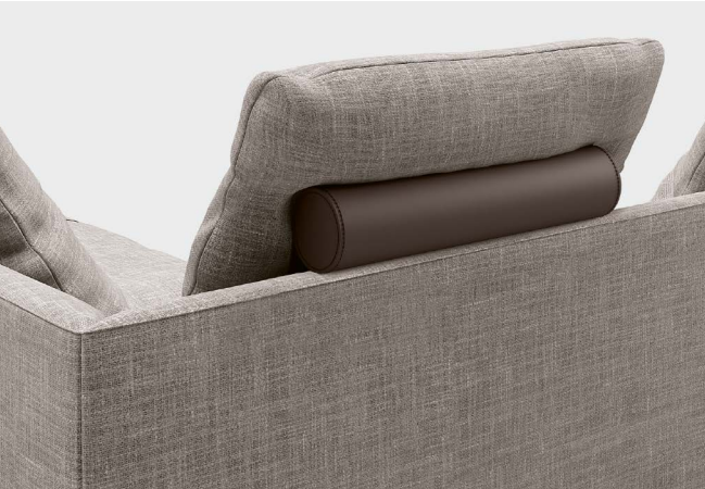
Looking for correct posture? The saddle leather bolster supports upright sitting. It can be positioned anywhere