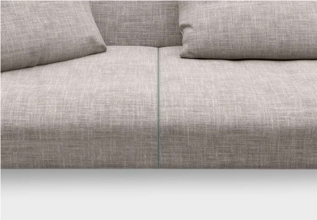
The open decorative seam in the seat cover is a sign of true craftsmanship