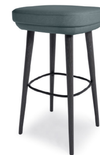
Open-minded: barstool for every occasion, in two seating heights