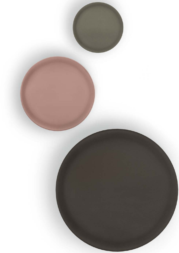
A range of diverse eye-catchers: the table tops are available in matt black or bronze, in copper lacquer or covered in leather

Norman Foster is one of the most successful architects of our time. His buildings have established standards for smart, extraordinary architecture all over the world. The Briton has won the Pritzker prize and the Gold Medal for Architecture of the American Institute of Architects and has been honored by the Queen with the title Lord Foster of Thames Bank. Norman Foster and Walter Knoll first started working together when it came to furnishing the Reichstag Building in Berlin. Since then, several lines have been created with Foster symbolizing the synthesis of architecture and furnishing, including the Foster 500 sofas and armchairs.