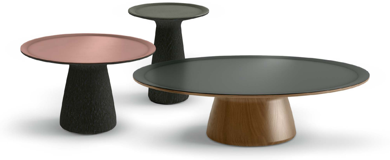
Solid and sensuous: the occasional tables with diameters of forty, sixty and one hundred centimeters can be combined to create artistic ensembles

Fascinating proportions: the trunk tapers in order to carry a slimline table top with safe elegance. The leather which can be used to cover the table tops is also high-grade. Since 1998, Walter Knoll and British star architect Norman Foster have been developing modern classics which have become some of our company’s most successful products. Foster 620 Table succeeds in cultivating the original, its design preserves and tames the natural resource wood. Organic shapes and the silky soft, leather surfaces of the table tops produce an occasional table which touches the senses and begs to be touched.