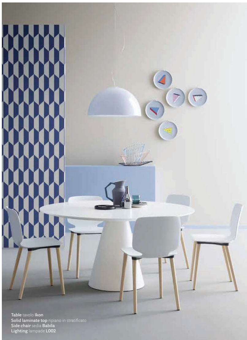
Table tavolo Ikon Solid laminate top ripiano in stratificato Side chair sedia Babila Lighting lampade L002