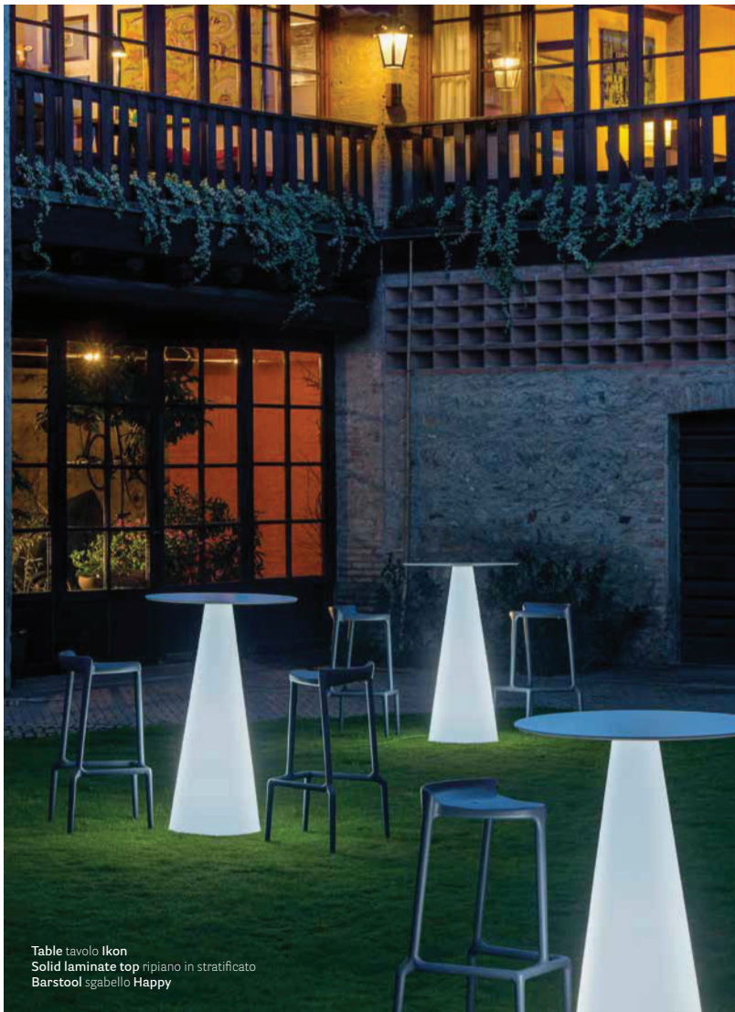
Table tavolo Ikon Solid laminate top ripiano in stratificato Barstool sgabello Happy