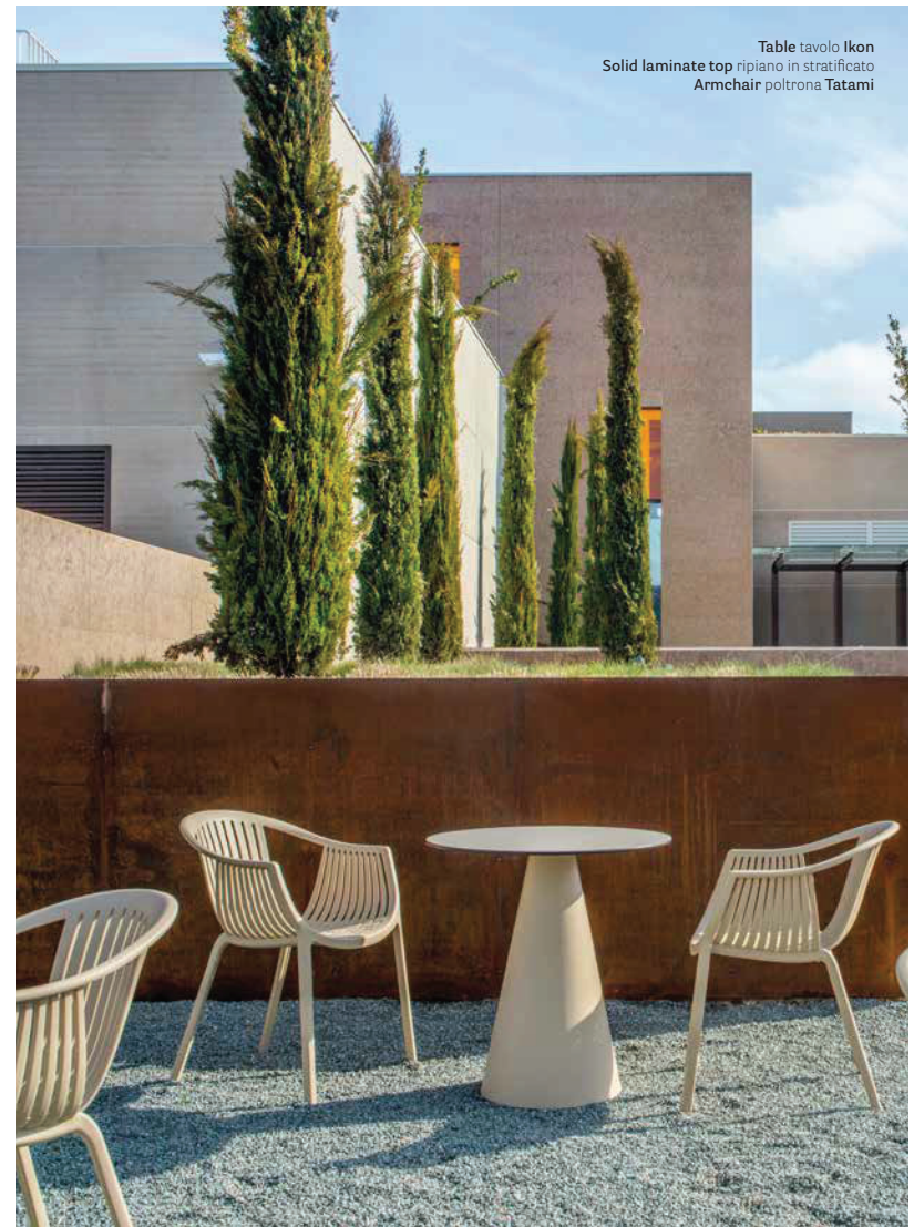
Table tavolo Ikon Solid laminate top ripiano in stratificato Armchair poltrona Tatami