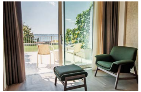
Hotel Olivi (Sirmione, Italy)